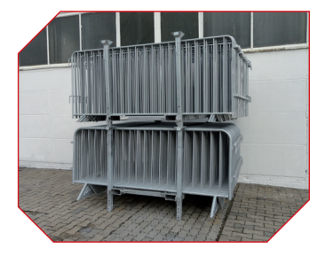
Up to 4 stackable on top of one another (2 on truck)